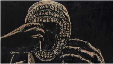
SOME ACTIONS WHICH HAVEN'T YET BEEN DEFINED IN THE REVOLUTION, Sun Xun, 13', 2011, China